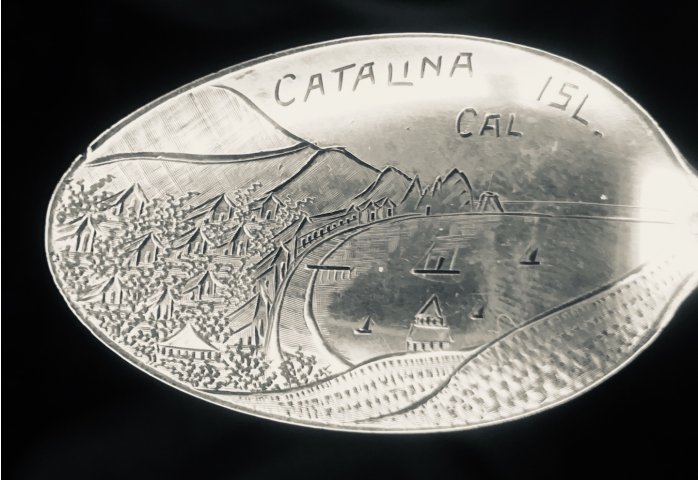
on Watson #311 - figural fish - not marked